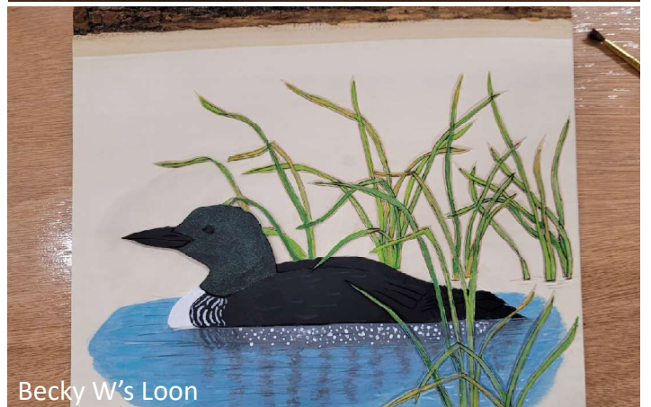
Becky W's Loon