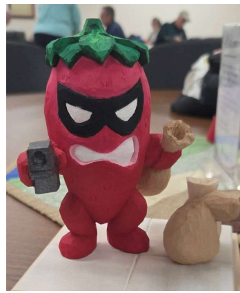
Left: Becky W's "Strobbery In Progress" is indeed progressing right along.