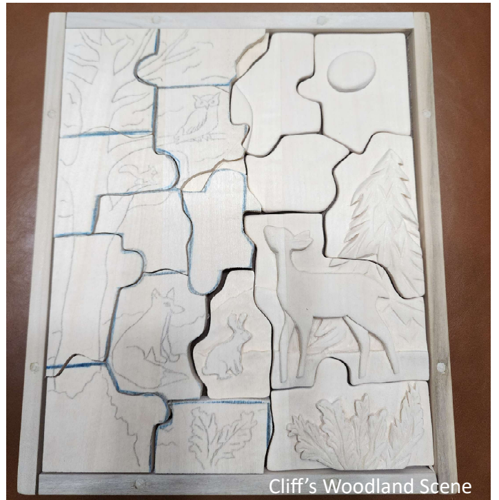
Cliff's Woodland Scene