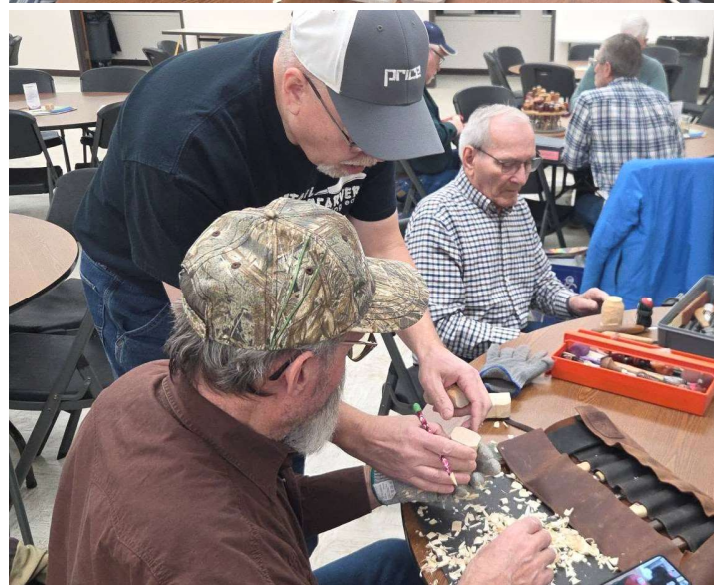
Above: Flickertail member work on their penguins.