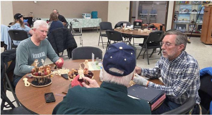
Below: Bob P's Cowgirl boot

It has many common names, such as black gum, sour gum, black tupelo, pepperidge, cotton gum, swamp gum. Five species of Nyssa grow in North America, from southern Ontario all the way south to Mexico, which dwell in moist areas. Three species grow in Asia, and one in Malaysia. The wood is pale yellow to light brown, with a fine texture. Tupelo wood is favored by bird carvers because it power-carves easily, and holds its shape well. At first glance Tupelo looks very similar to Basswood – but they sound completely different. If you run your fingers along a board of each, sound is produced. Basswood is a lower tone, while Tupelo is a higher note. This is a handy trick when you're sorting through unlabeled donated wood in a box!