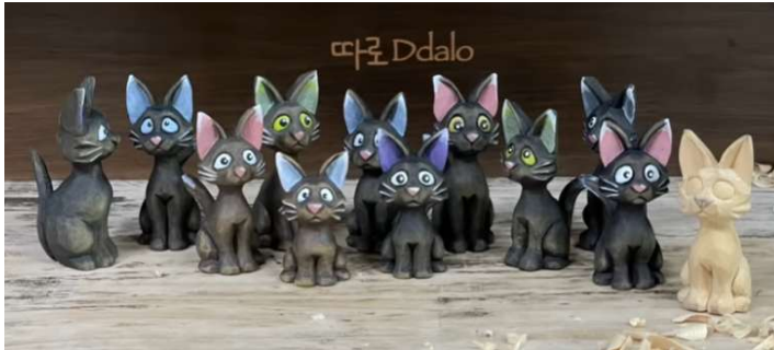
Above is his "Carving a Little Black Cat", and below is "Carving a Little Grim Reaper".

yet, I highly recommend it. He periodically comes out with adorable carvings and works through step-by-step each cut. There are generally no words spoken, rather it's all pointing and showing the piece off from different angles. As you can see from the penguins from the video screenshot on the previous page, they all have the same basic feel, but there is some individuality in the carvings as well. One scarf is solid, another has fringes, some have more wrinkles than the others... while one hat has ribbing, another a top pom-pom, etc.. So he gives you the basic pattern, and from that you can go wild with details of your own choosing.