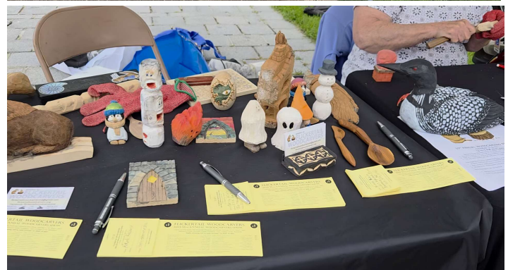
Above: New setup on the Library pathway for Capital A'Fair! This allows us to be right next to the curb, easy access for walkers / scooters / strollers / and wheelchairs alike. Raffle tickets are still only $1 each – with plenty of cool carving prizes for winners.