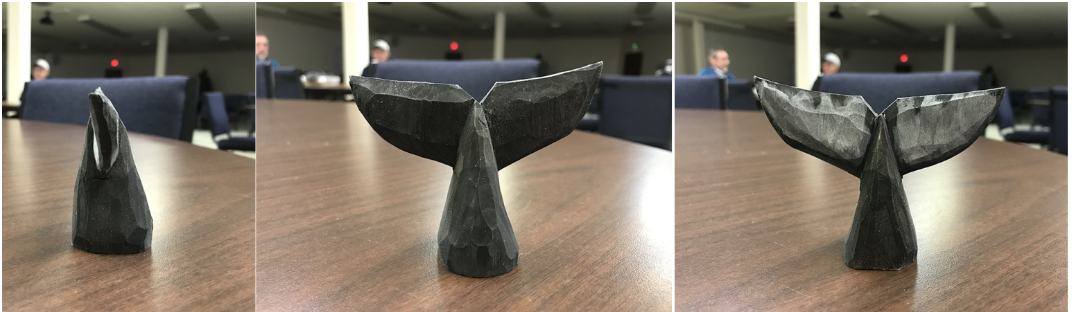
Carved & painted whale tail

If, however, you've decided to carve the mermaid tail option (above right), then think FISH. The tail-to-fin contact should be smooth, without the peduncle. Unless of course your mermaid is part whale? As for coloring - yes - color is good. Pick a color! Or colors!