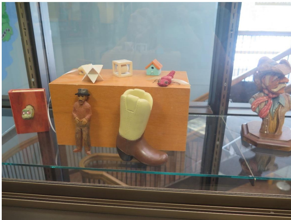
Finally: a cowboy, trinkets, Telle's dragonfly and man, and a bookworm