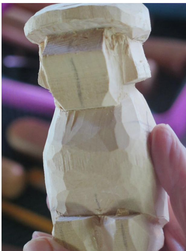
A Harley Refsal caricature