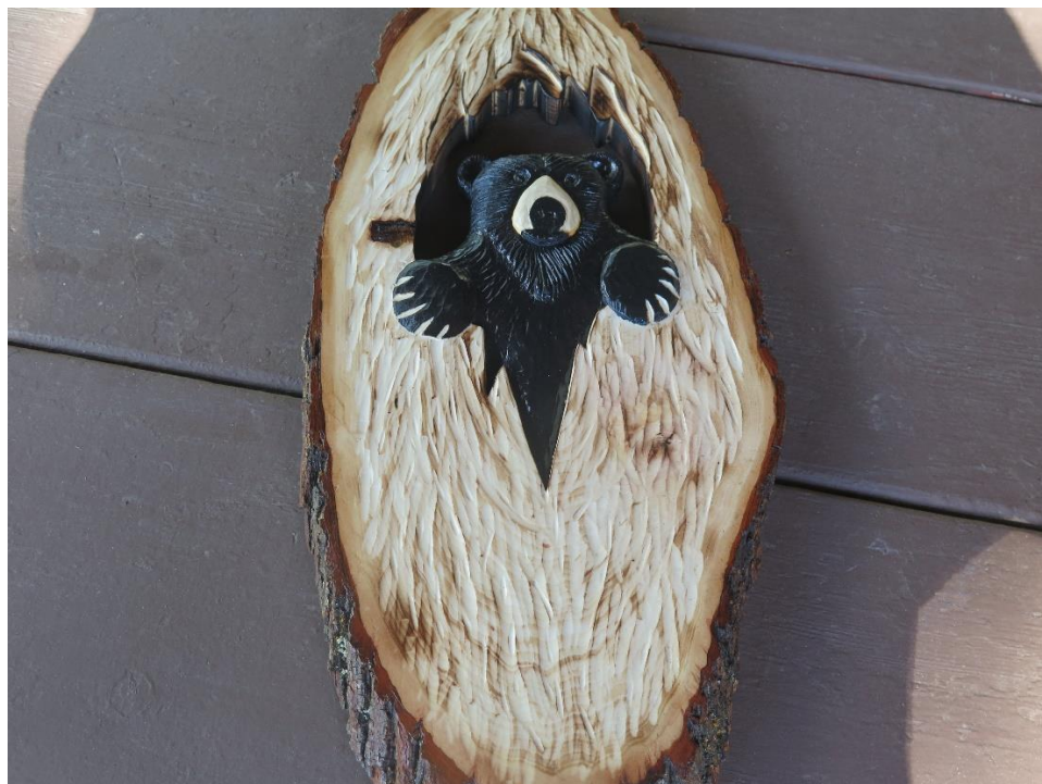
A black bear peering out