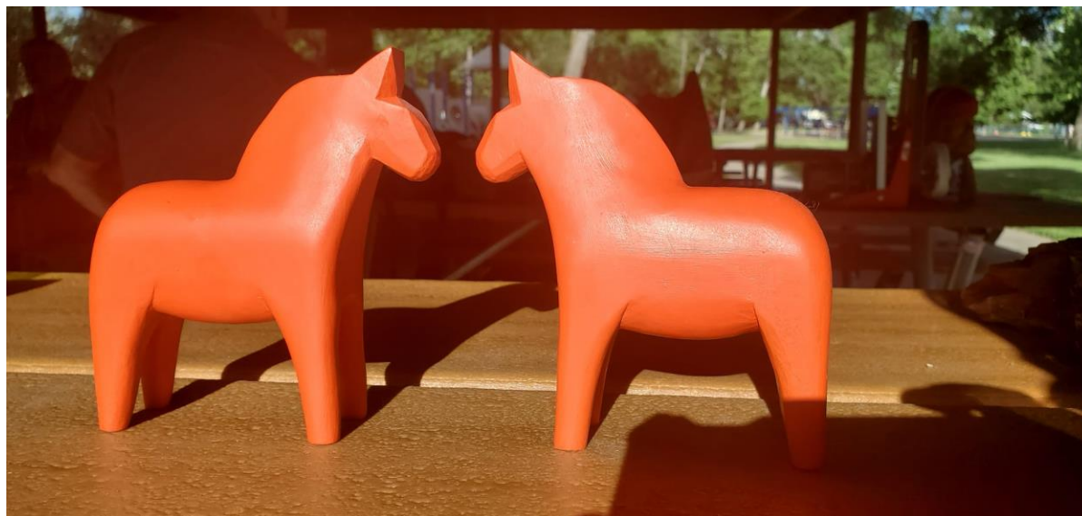
Two red Dala horses