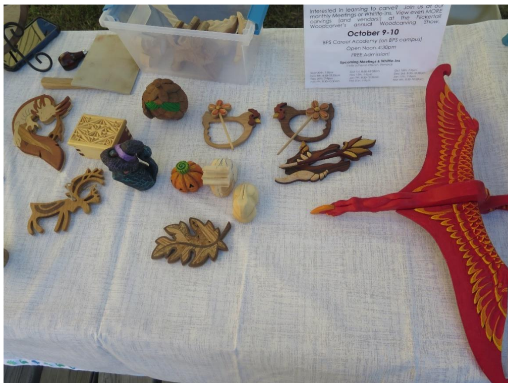
Becky B's woodcrafts