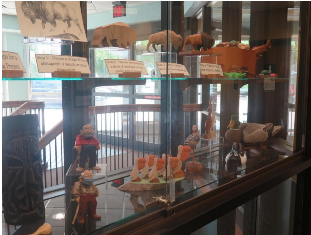
Bison, pelicans, two old men, ducks and an outlandish mask