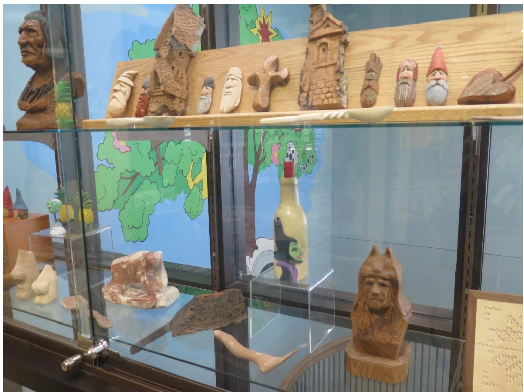
Including some gnomes, bark houses, two busts and a Halloween bottle