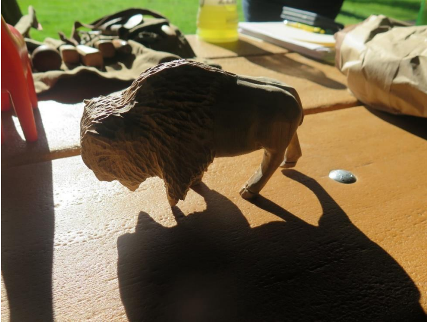
A bison in sun down shadows