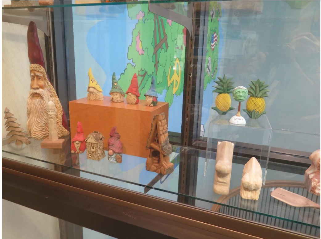
In progression: pineapples, a golf ball, noses for glasses and Santa