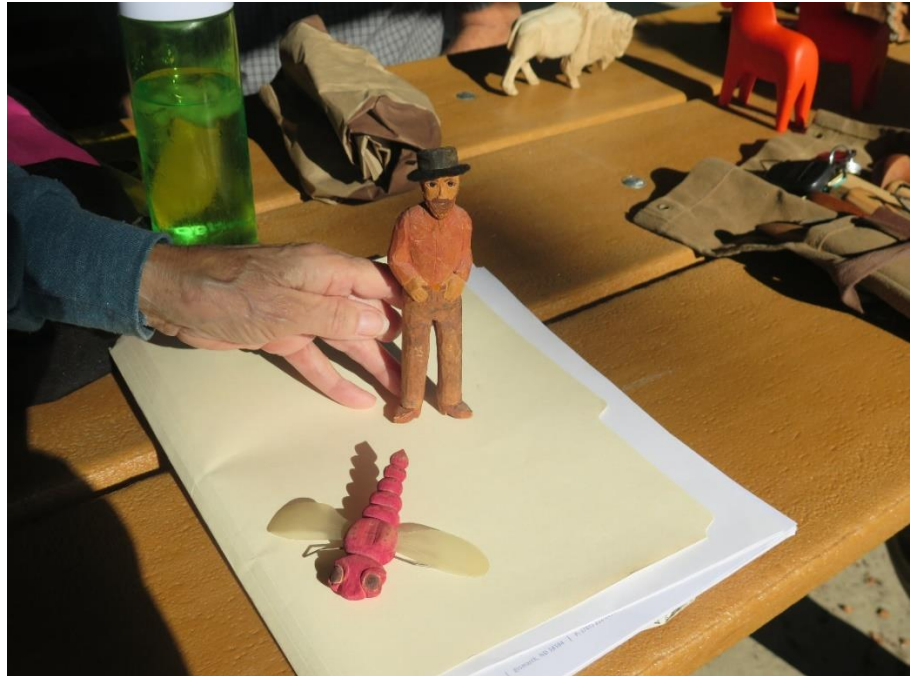
A dragonfly and man from Telle's Whittle-In classes