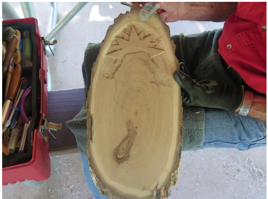
The beginning of Mother and Child in relief