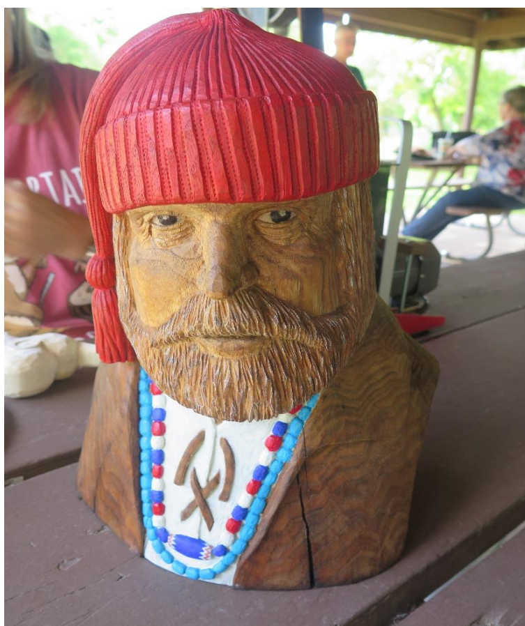
A life-like voyageur in butternut