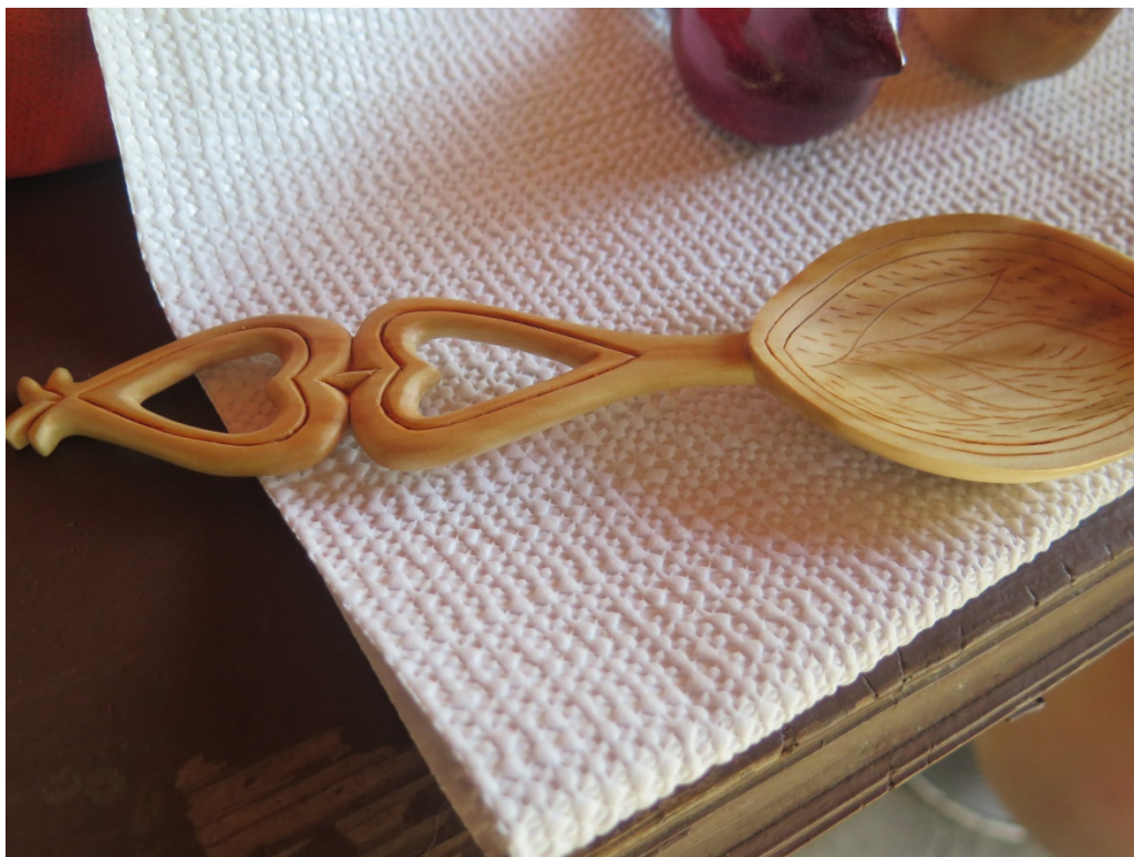
A well-made Love Spoon with kolrosing in the bowl