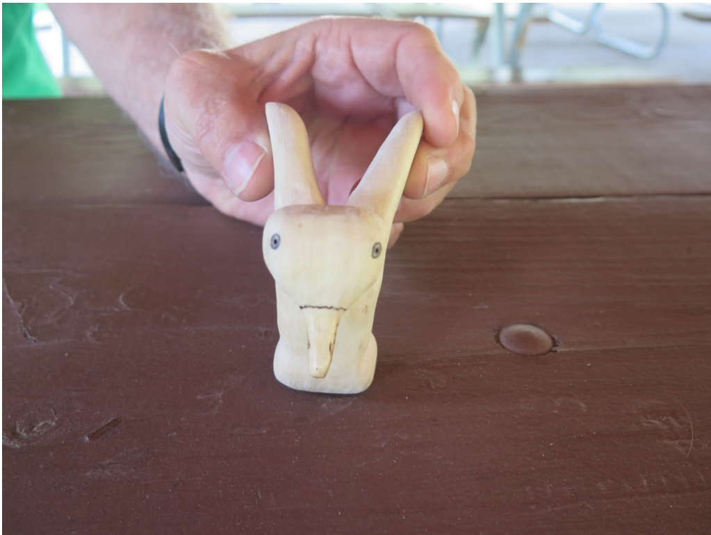
A humming bird in flight