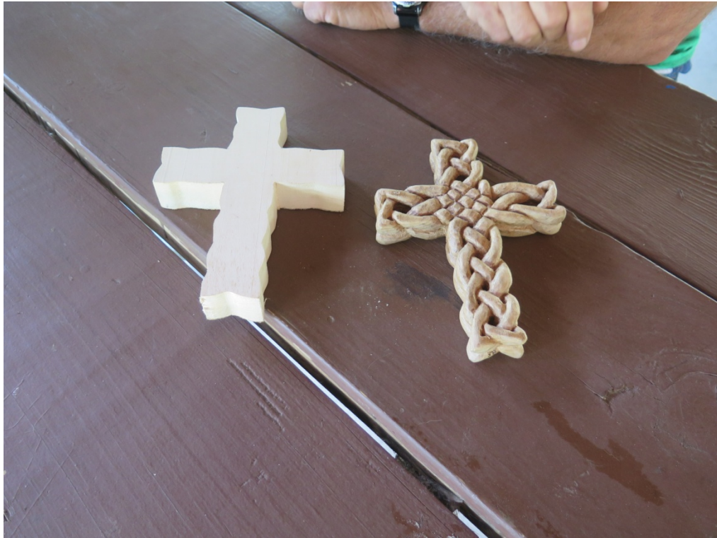
A Celtic Cross and template