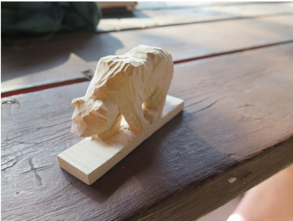
Bear in the final stages of being completed