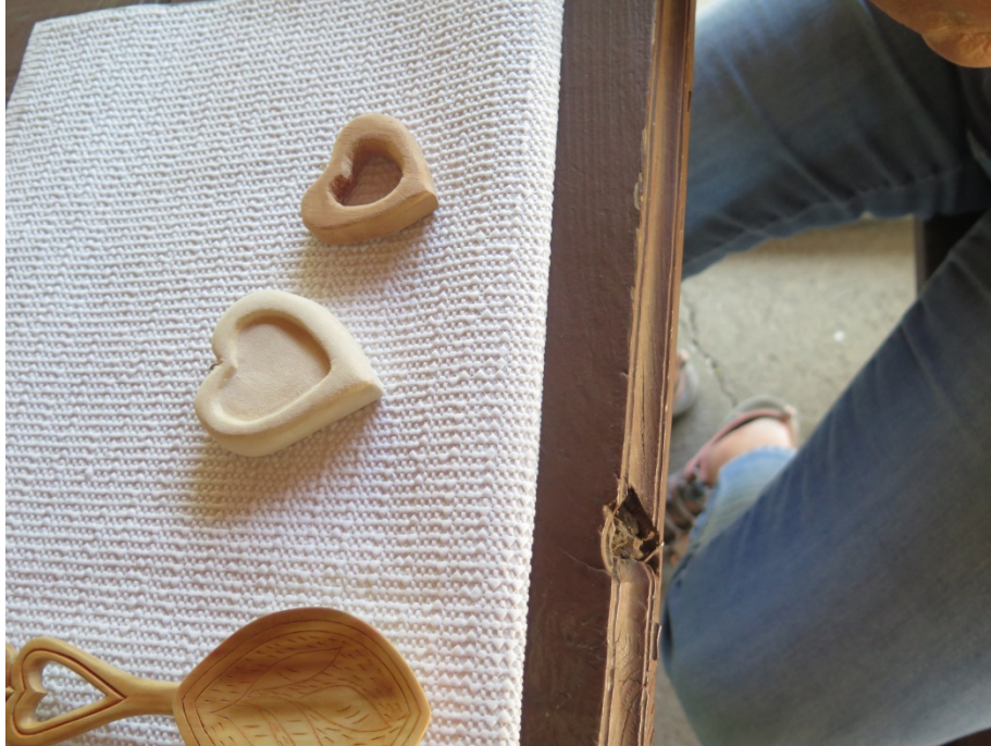
Two more Cancer Hearts