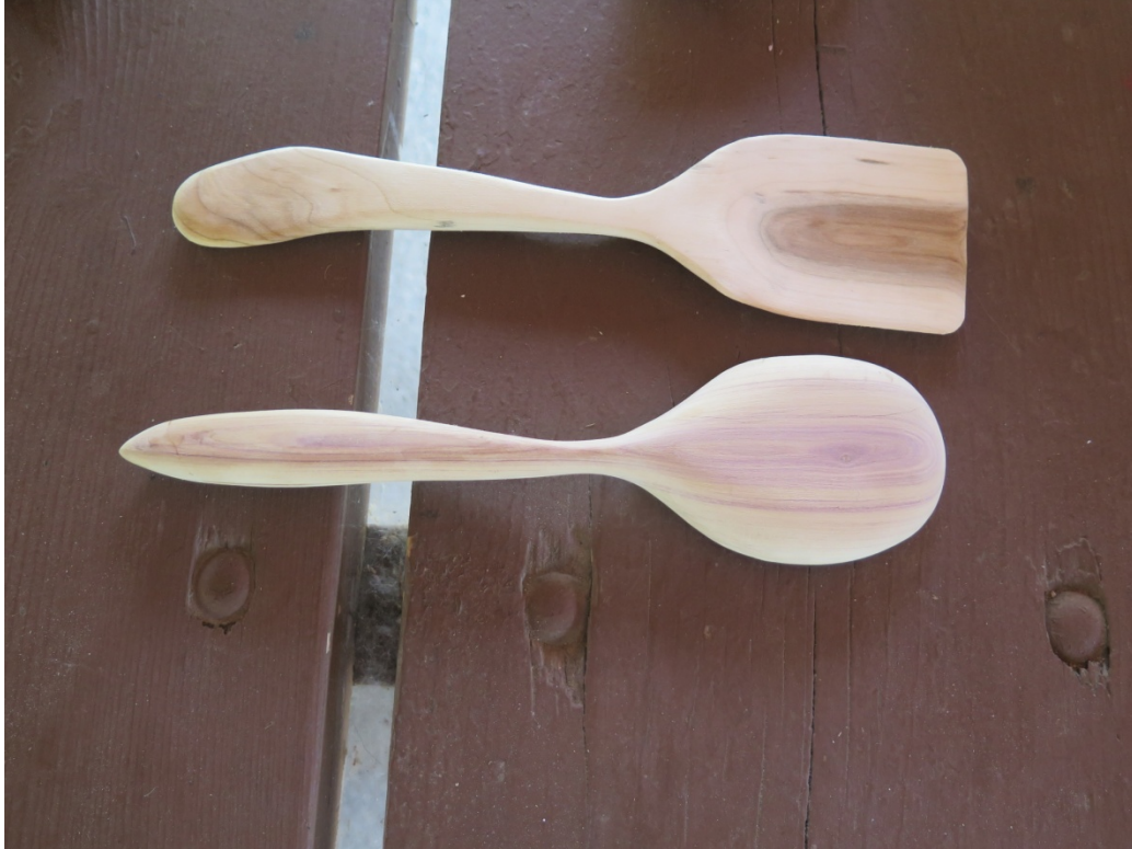
A spoon of lilac and a spatula of black walnut