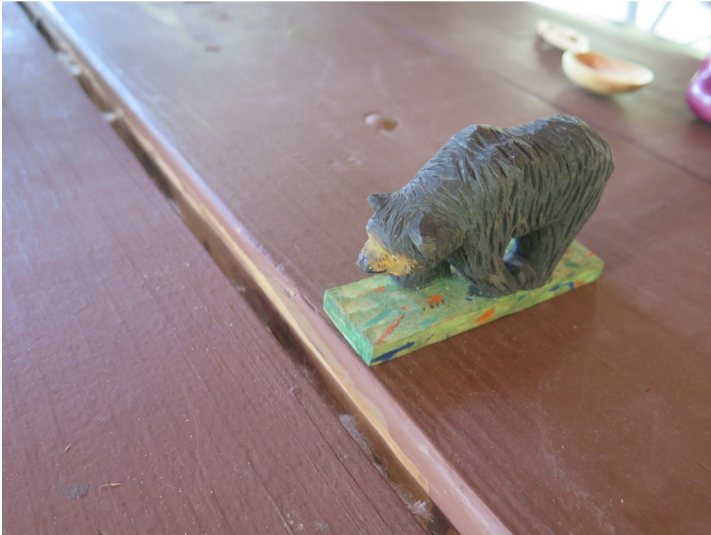
A finished black bear