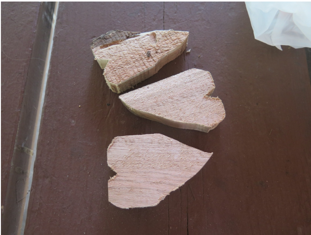
Rough outs for Cancer Hearts