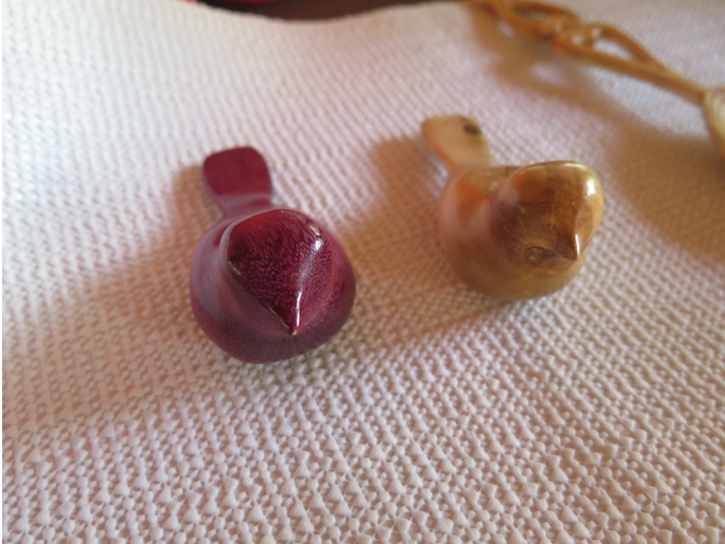
Larry's two highly polished keepsake comfort birds