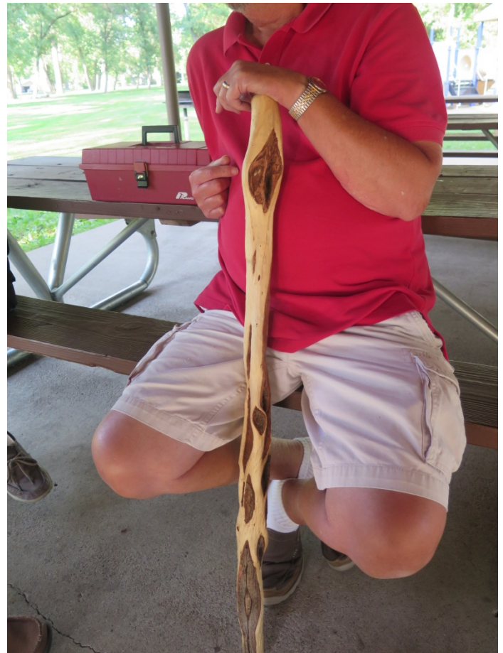
A difficult diamond willow walking stick