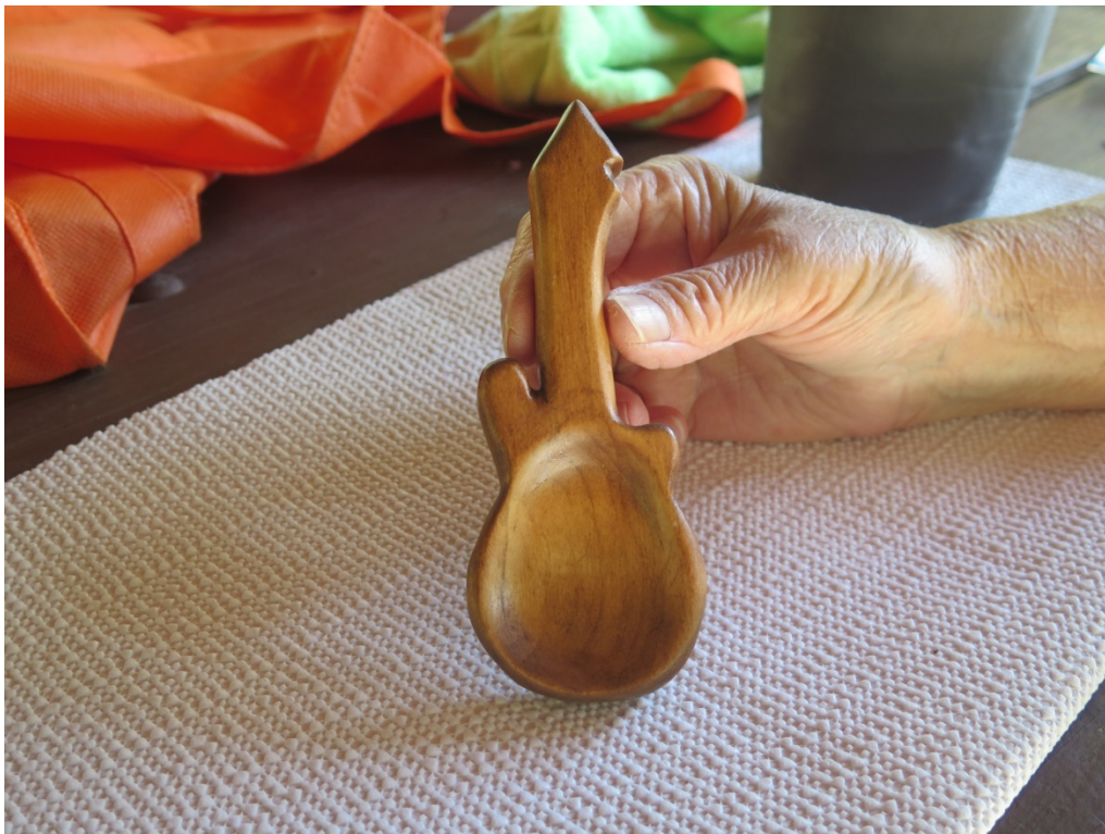
Eileen's polished guitar spoon