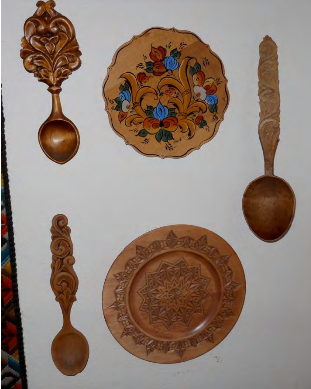
Figure 6. Spoons and plates