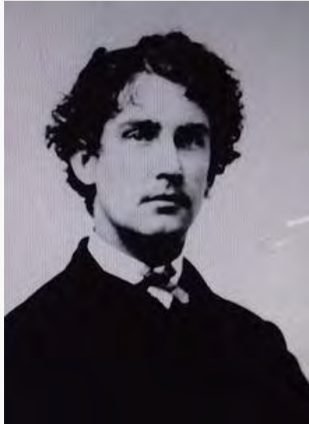
John Haley Bellamy, circa 1856