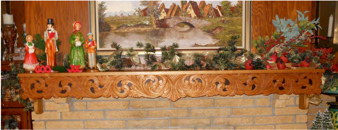
Figure 3. Mantle