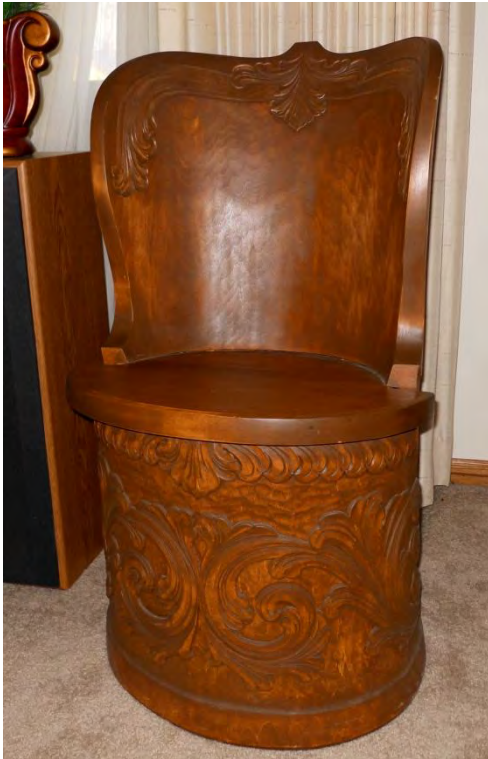
Figure 4. Kubstol