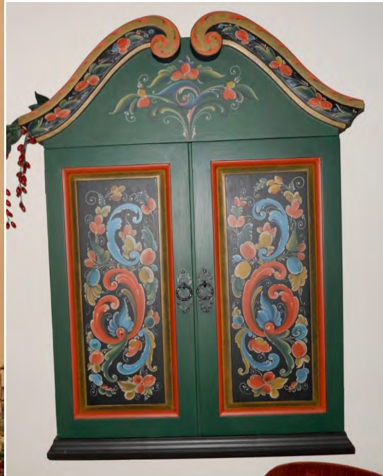
Figure 2. Cabinet