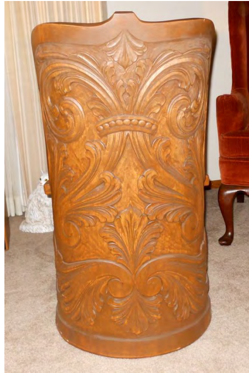
Figure 5. Backside of Kubstol