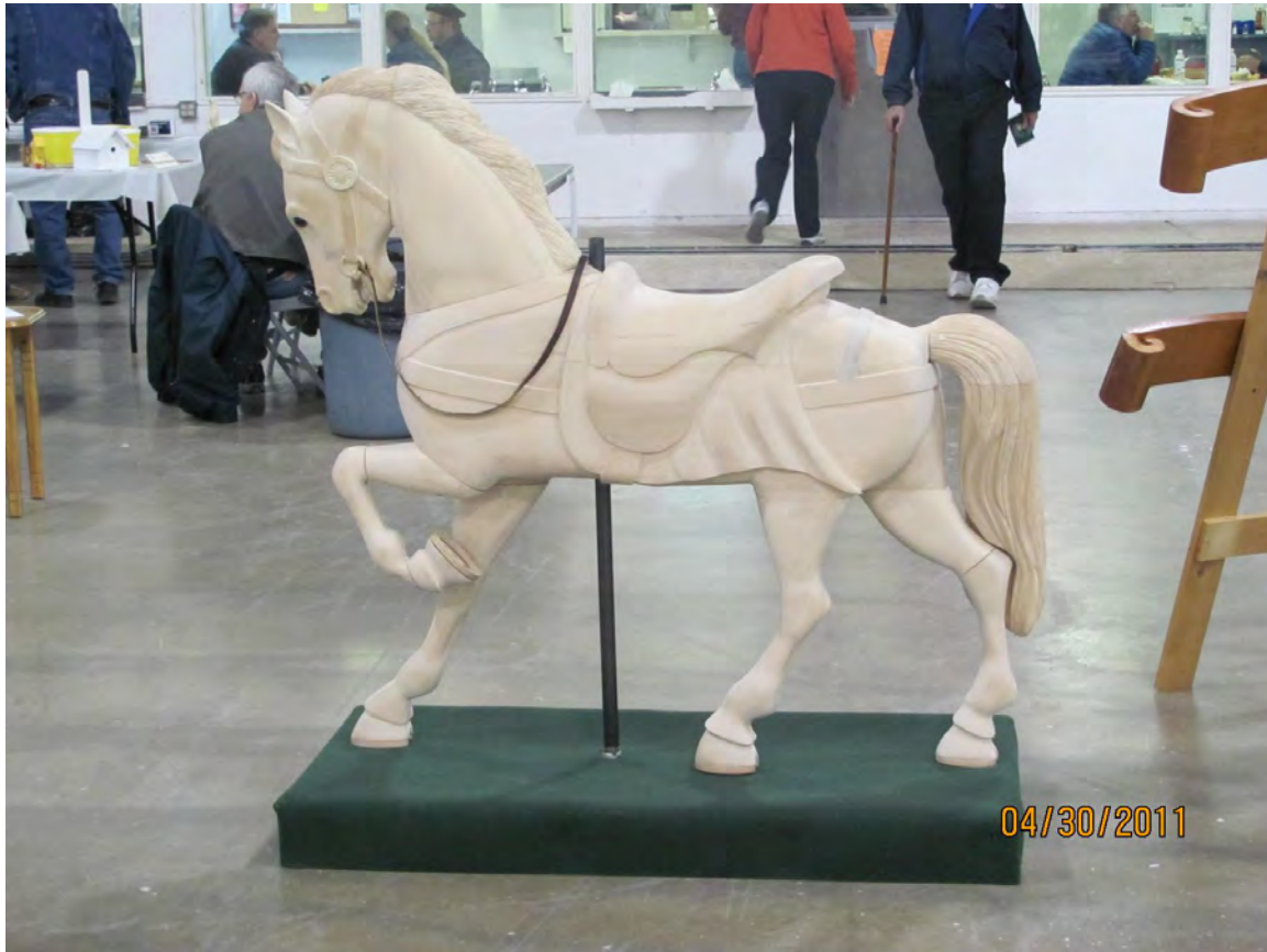
A carousel horse – From the Regina Show

..... The summer schedule is to be at Shelter #4, Sertoma Park. Time will be 6:00 p.m. to 11:00 p.m.