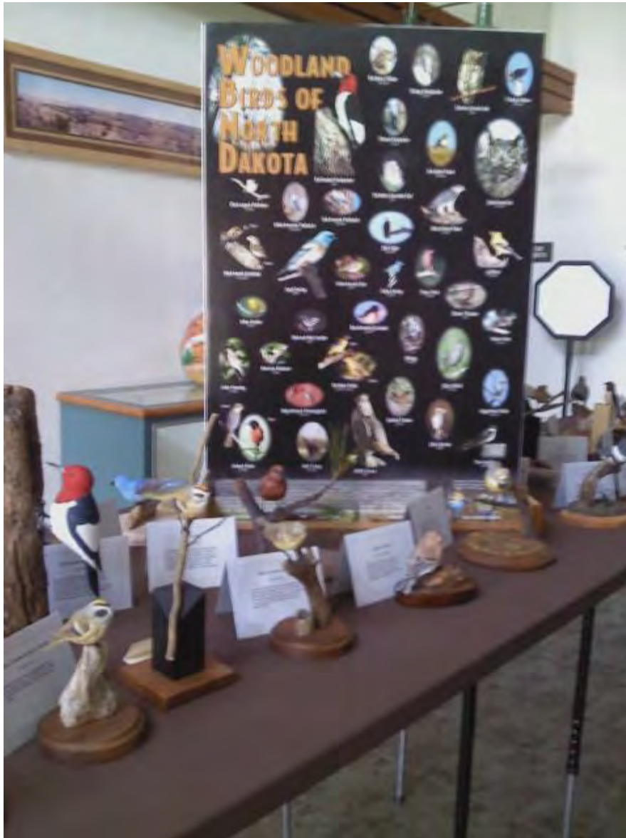
Our bird exhibit at Medora