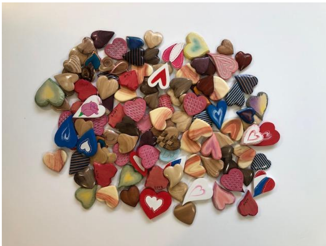
Some of the hearts from the September Campaign to Carve Hearts

Addendum: So far, we have given over 1,500 hearts to the organization. They have a need of about 50 per month, and are expanding their operations to assist more patients, meaning they will want more hearts than before.