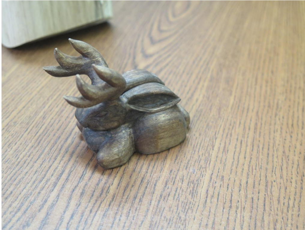
A dark stained jackalope