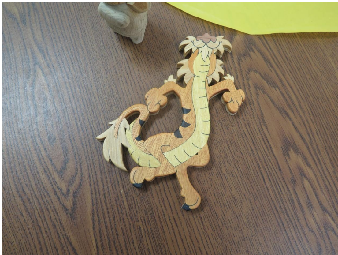
Garfield Dragon dancing happily

Larry’s comfort birds are wonderful to see. The different shades of blue and gold wood on one flow over the bird’s head and highlight the wing. The more muted colors of the other encircle the bird. Ruth has shelves on which to place the comfort birds. These will be a good addition.