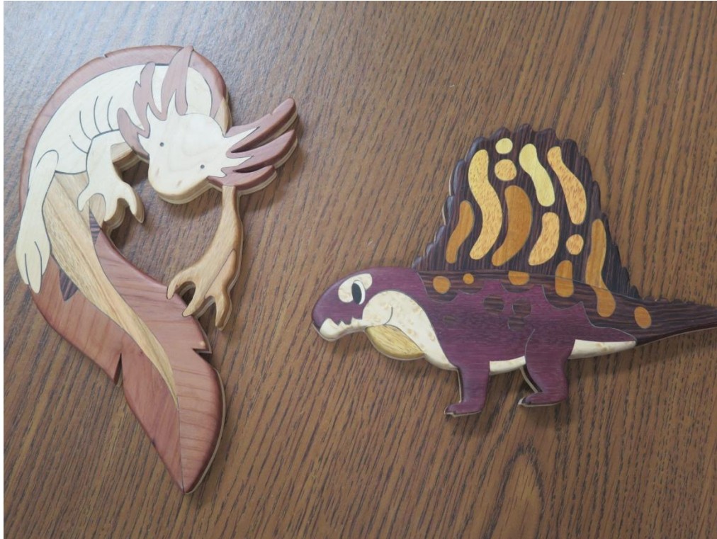
An axolotl and a diminutive dimetrodon