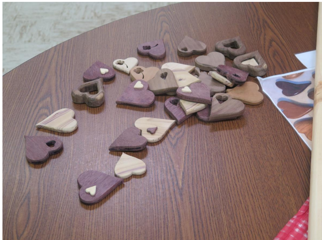
A cascade of hearts for the Cancer Society