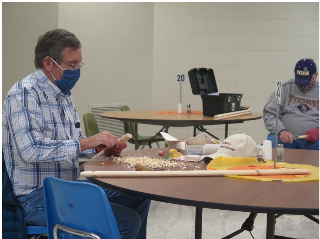
Two snake whittlers