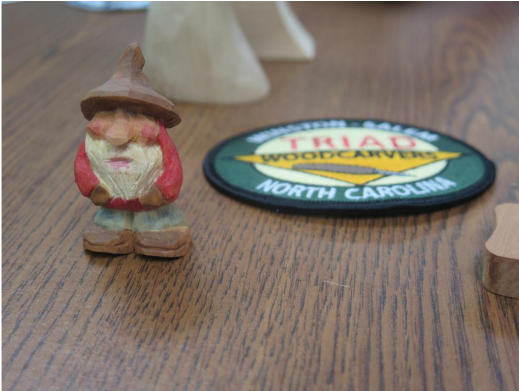
A tiny man with a Triad Woodcarvers Winston-Salem North Carolina patch