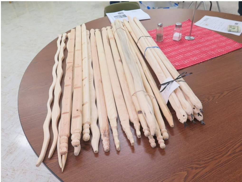
A wide variety of snakes