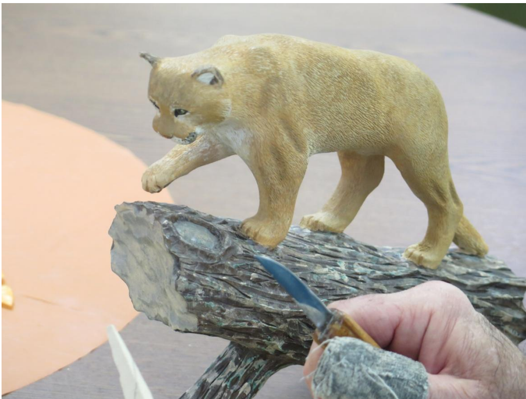
Bob P's mountain lion