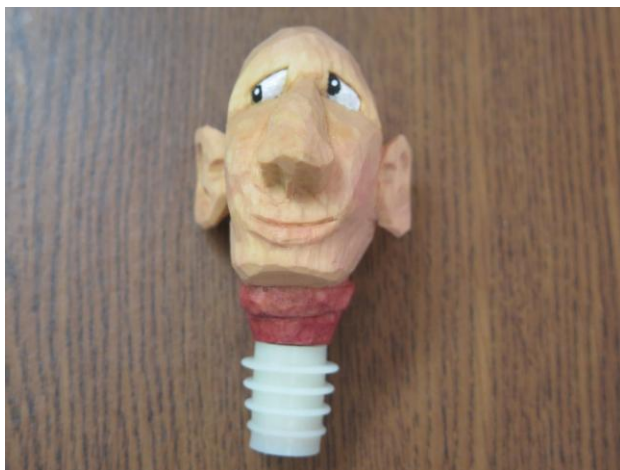
A bottle stopper with a human head