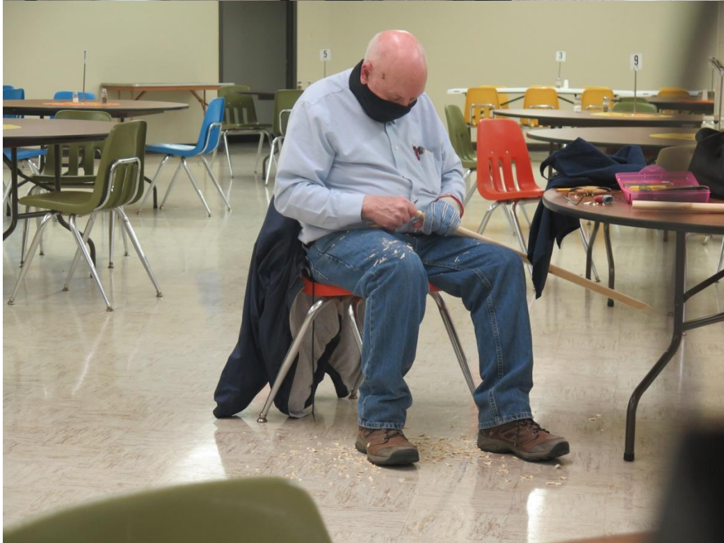
Here are another three whittlers whittling snakes