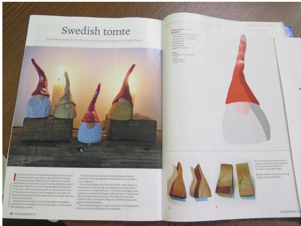
Eric's book on Tomte