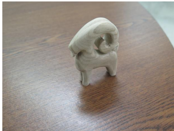
A fine looking complete Yule Goat