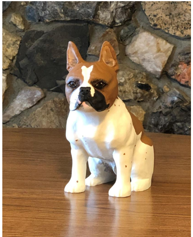
A well-carved French Bull Dog