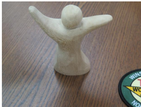
A figure of inspiration – Hope