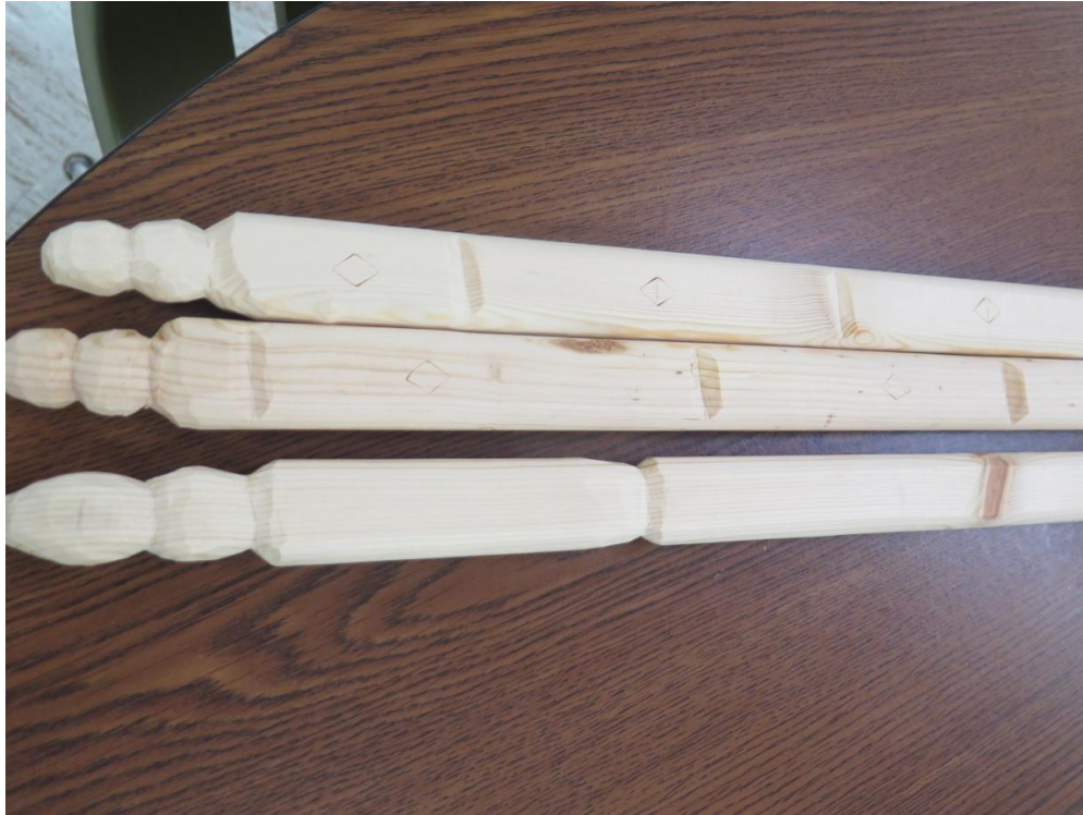
Ron H's snow snakes ready to go