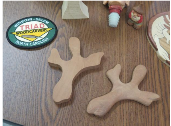
Comfort Crosses from North Carolina