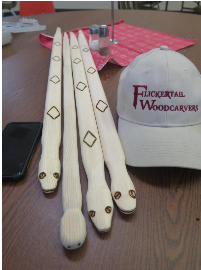
The final members of our den of snakes