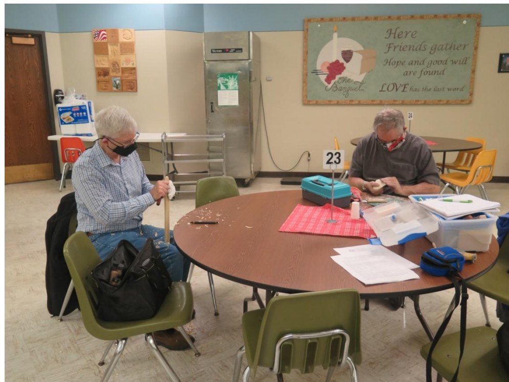
A table of hearts and snakes