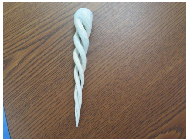
A lovely two-strand icicle in an ice blue color with sparkle