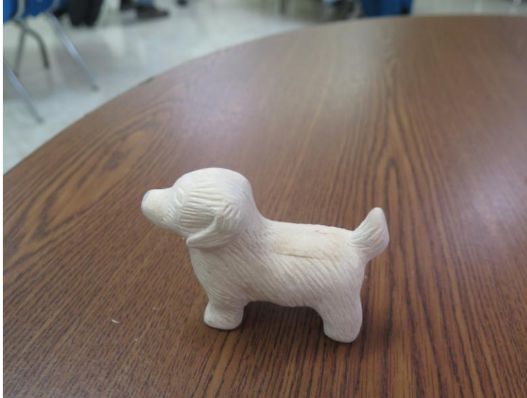
An attentive puppy