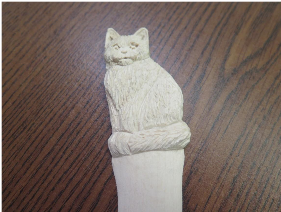
A long haired domestic cat letter opener