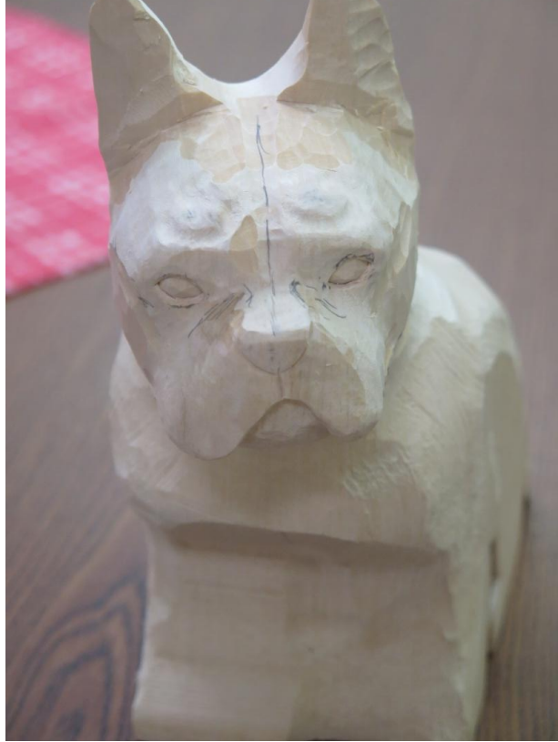
A true representation of a French Bulldog's head