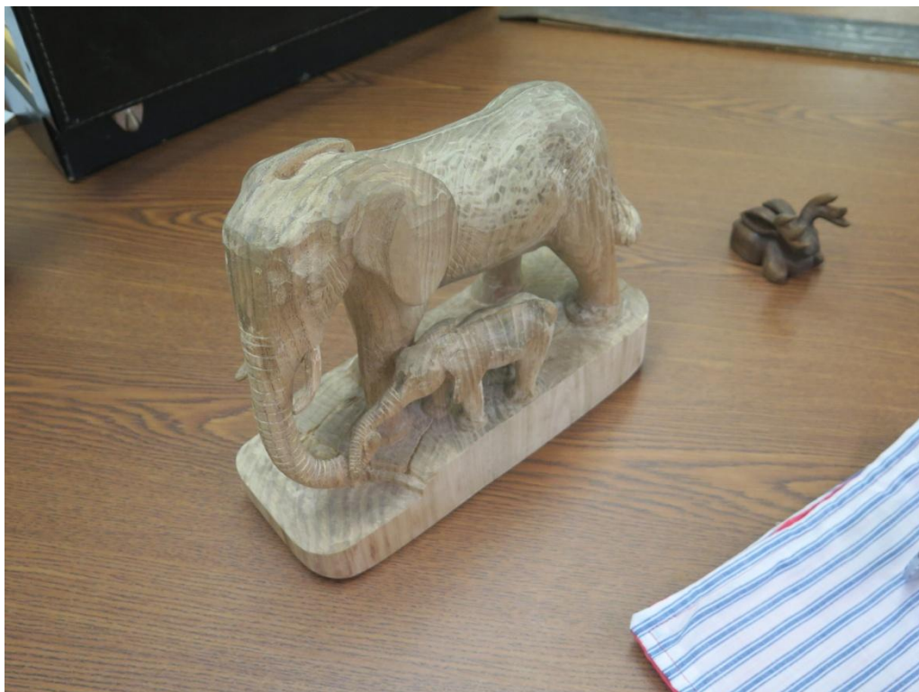
A mother elephant with her baby