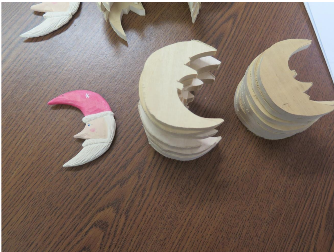
A small Santa next to larger blanks