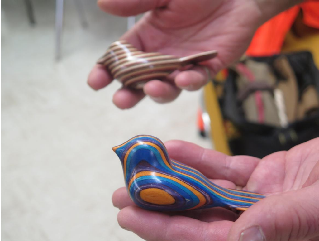
Larry's comfort birds