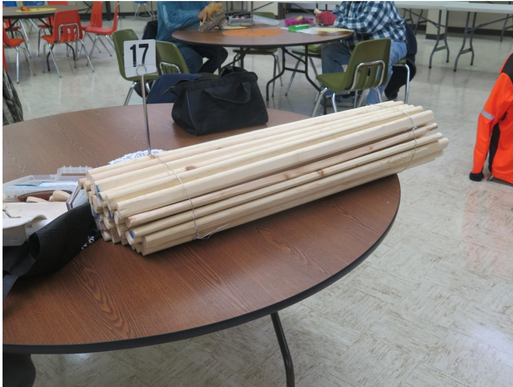
Wood to be fashioned into Snow Snakes