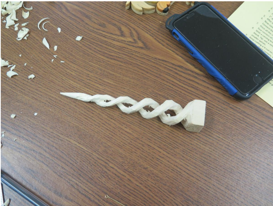
An icicle almost complete

Some of the people working on the icicles made a lot of headway. Becky B nearly finished hers.