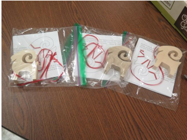
Yule goat kits in basswood and butternut