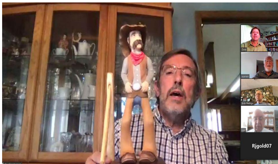
Finished template from the past