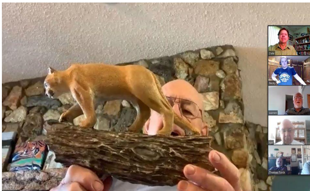
Bob's mountain lion on a log