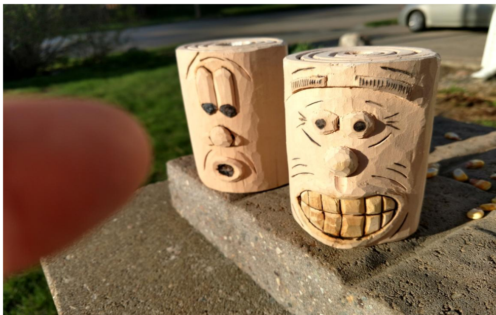
Eric's toilet paper - right is the last roll, left is the end of the roll